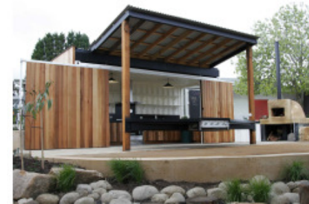
MODIFIED SHIPPING CONTAINER WITH BARN SLIDING DOORS AND ROOF